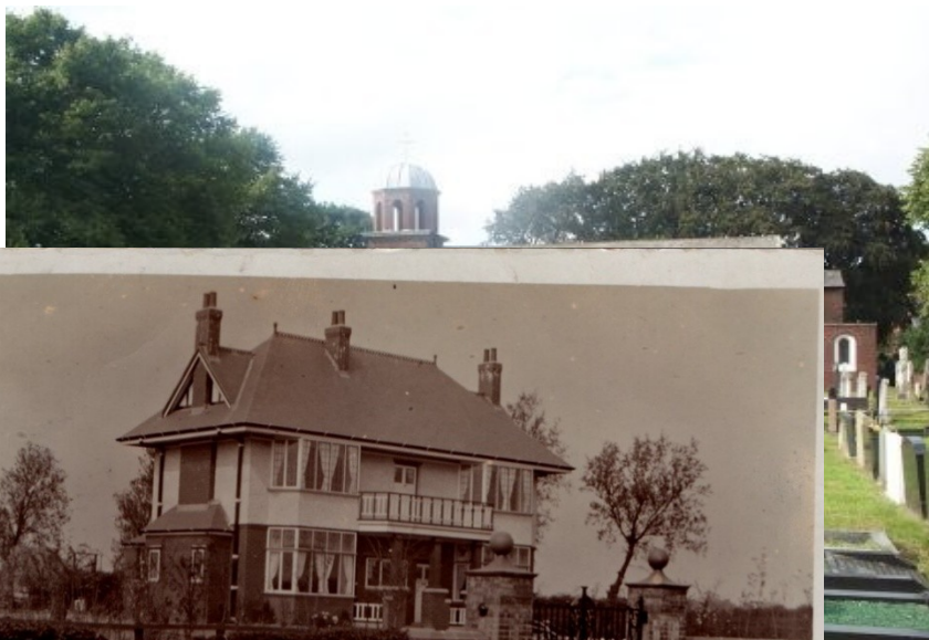
CHURCH METHODIST CHURCH