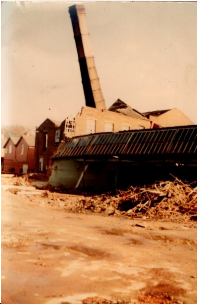
DEMOLITION OF MILL