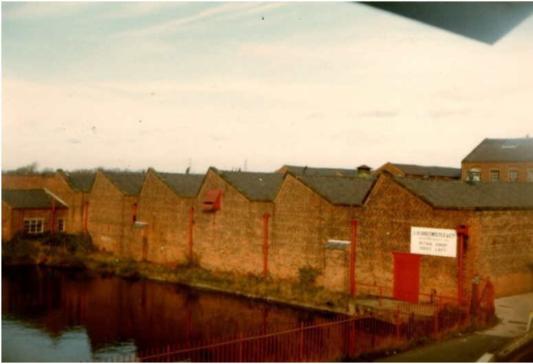
MILL POND (now Balderstone Road)