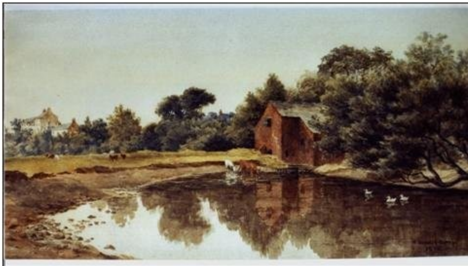
Painting of the old water mill (Ship Inn in the background)