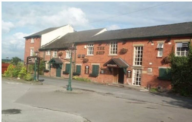
The Ship Inn

THE VALUE 12, Douglas Drive, Freckleton. PR4 1RY..Painting & Decorating Service.