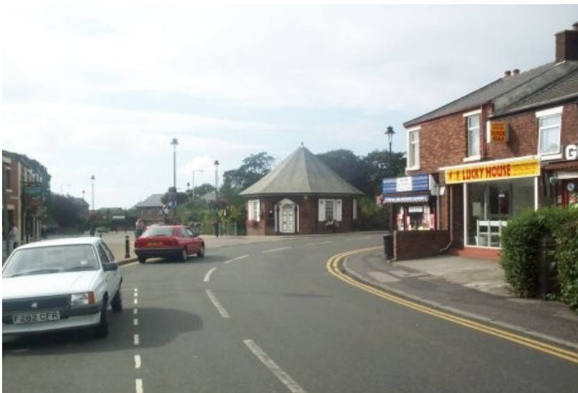
PRESTON OLD ROAD

Anyon's Caravan Storage (Preston New Road)