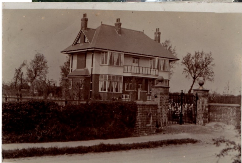
SEDGELEY MOUNT NOW SEDGLEY MEWS