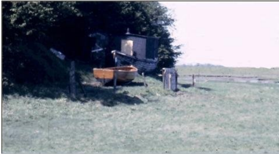
Old house boat and salmon fisherman's rowing boat at Freckleton Naze